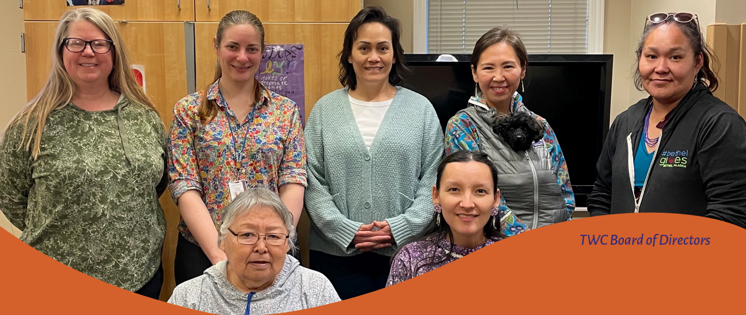
TWC Board of Directors